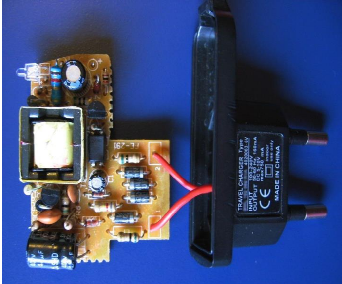
Both PSU's convert Mains AC to DC. The switch-mode is cheaper to manufacturer, produces less heat, but can introduce more noise than the Linear Supply. For Best Performance only use a quality Regulated, Isolated Linear power supply or professional high quality guitar intended switch mode.

Pending availability a 9v Battery to 2.1mm DC Jack adapter cable may accompany your pedal. This cable is not intended to permanently operate your pedal. Although batteries may be used, they will have a shorten life due to the high current requirements of the pedal. They are included as a troubleshooting tool. A 9v battery is a perfect no noise isolated power source, which can be used to test the pedal works perfectly and to be a reference with questionable power supplies to determine noise.